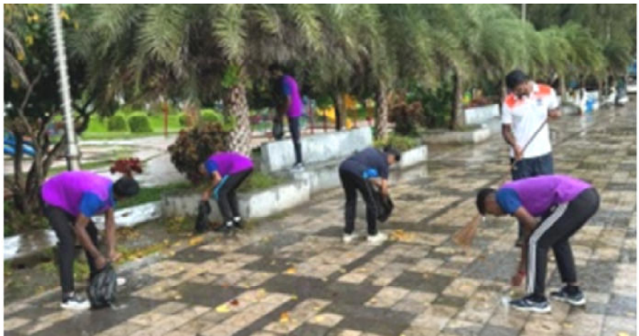
As part of Swacchta Hi Seva 2024 Campaign, a cleanliness drive was organized by Sports Authority of India, STC, Sri Vijaya Puram at Marina Park.

saving the students from becoming victims of drugs. She also emphasized that the National Education Policy 2020 has laid emphasis on taking up Curriculum and pedagogical initiatives for promoting holistic health, nutrition, physical education, fitness and wellness etc. among the students. She further thanked the Health Department, Police Department and the Social Welfare Department for their valuable support in providing Expertise Resource Persons and other support to train the Master Trainers, a press release from Principal, SIE said.